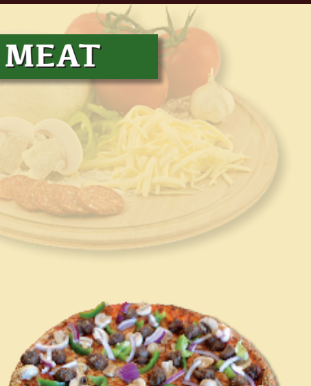
#12 Garlic Italiana White sauce, pepperoni, Italian sausage, fresh mushrooms, fresh tomatoes, green onions, chopped